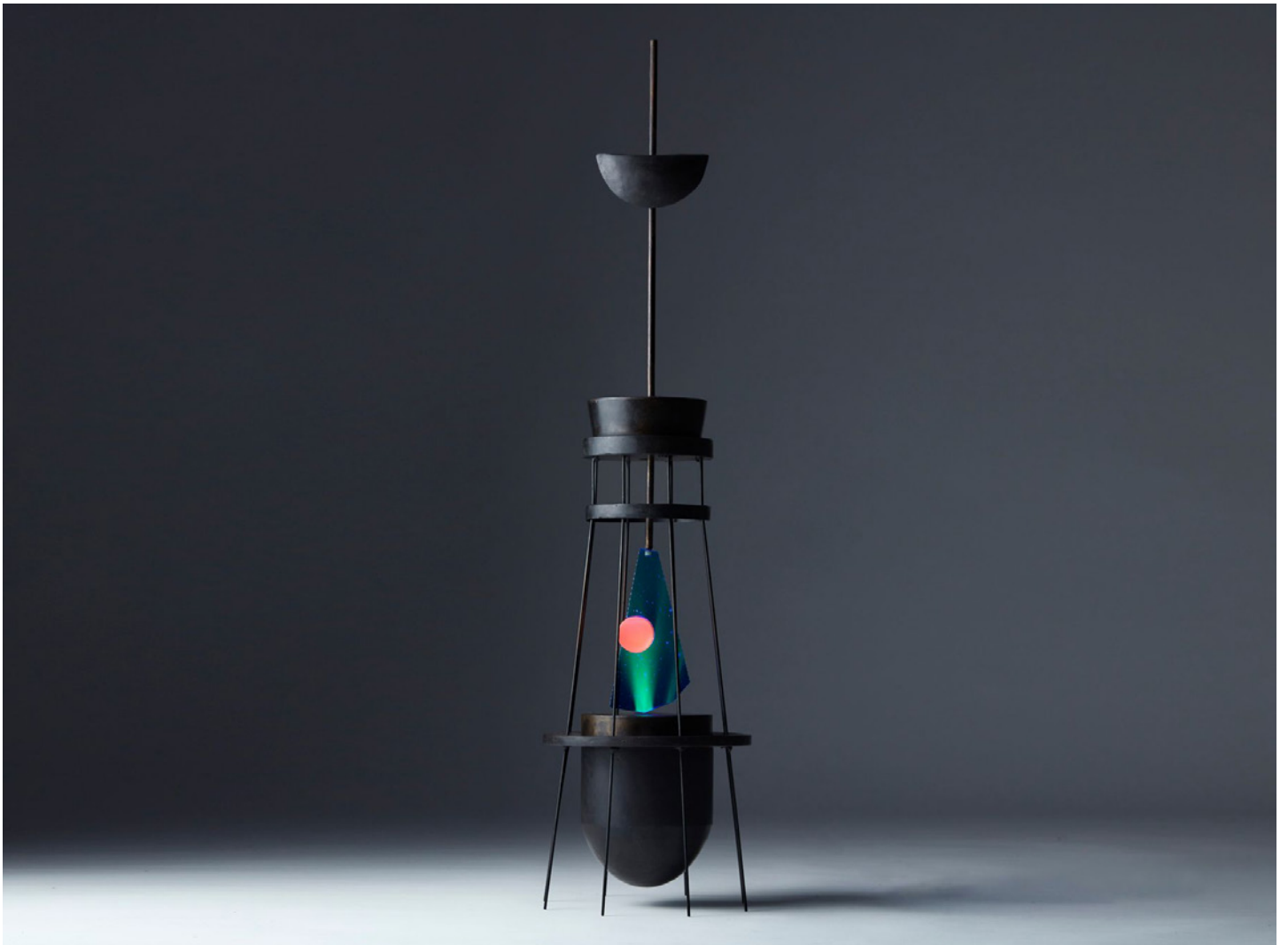
Concrete bead necklace. Marion Colasse / Moving luminous sculpture. Emilie Braun - Rights reserved